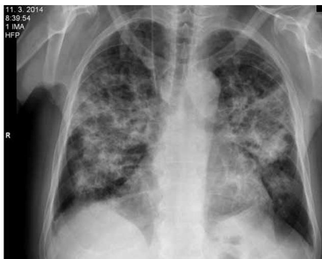
Figure 3. X-ray findings in the lungs of a patient with pneumocystosis

In order to approximate the clinical manifestation of P. jirovecii infection in an oncology patient, where etiological agents were confirmed in our laboratory, an X-ray image with a complicated pneumocystic infection with a marked spotting of both lung wings is attached (Figure 3).