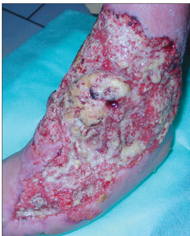
Fig. 1. A large ulceration on the left lower leg and foot with a slightly elevated edge and the malignant proliferation in the central area of the lesion.

On admission a huge ulceration on the left lower leg and foot was noted (Fig. 1). The edge of the ulceration was slightly elevated and in the central area of the lesion proliferation of the tissue was seen (Fig. 1). The surrounding skin showed slight erythema and maceration of epidermis. The peripheral lymph nodes were not enlarged. Additionally, a small nodule (about 0,5 cm in diameter) with a dilatated vessels on the surface was stated on the right lower lid.