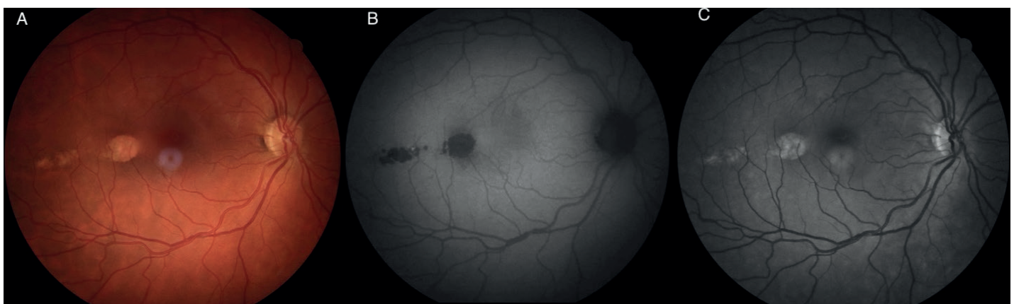
Figure 1. Fundus photo (A) of the right eye with torpedo maculopathy, fundus autofluorescence (B) shows areas of hypofluorescence in the place of the main and satellite lesions, the red free image (C) highlighted the lesion

Torpedo maculopathy is a rare, benign retinal lesion. The typical finding is a unilateral hypopigmented lesion temporally from the fovea, with the tip directed towards the foveola [5]. Atypical forms of TM have also been described in the literature, as a bilateral finding, two torpedo-shaped lesions in one eye, a hyperpigmented TM lesion or a case of inferior TM with the tip oriented towards the optic nerve papilla [8,10]. TM is described as a solitary lesion, but satellite lesions may also appear, located in a single line with the primary lesion. All satellite lesions described to date are smaller and localized temporally [11]. TM is usually a chance finding in asymptomatic patients, it is of a non-progre-