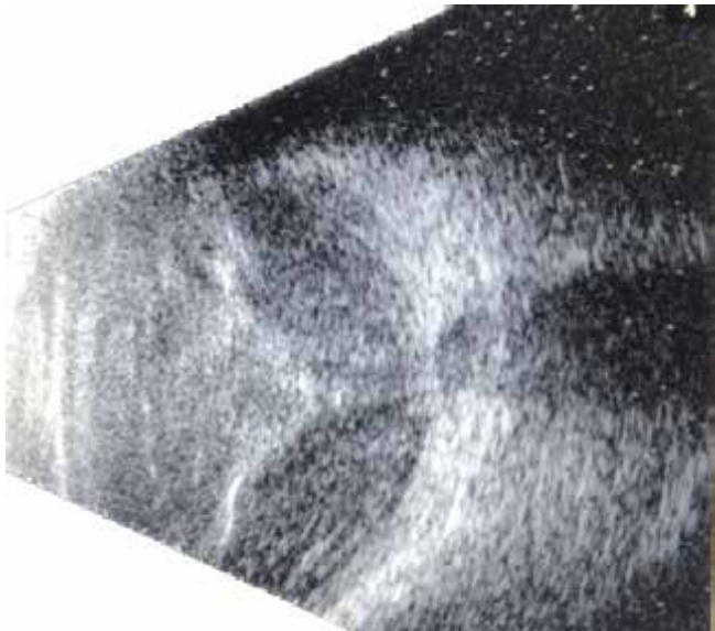
Figure 1. B-scan demonstrated a near-kissing suprachoroidal hemorrhage

the right eye was deep with an open angle. His intraocular pressure (IOP) was 68 mmHg over the left eye and 19 mmHg over the right eye. Fundus examination revealed suprachoroidal hemorrhage and was confirmed with an ultrasound scan (B scan) of the left eye, which demonstrated a near-kissing suprachoroidal hemorrhage (Figure 1). His blood pressure (BP) was 196/106 mmHg. His complete blood count and coagulation test were normal. He was admitted; thus, oral Acetazolamide 250 mg four times daily and syrup glycerol (1 g/kg body weight) thrice daily was commenced. Locally Gutt Timolol twice daily, Gutt Latanoprost at night, Gutt Dorzolamide thrice daily, and Gutt Brimonidine thrice daily were given to control his eye pressure. Two antihypertension medications were also started to control his blood pressure. Despite maximum medical therapy, his intraocular pressure was persistently high. He underwent left eye suprachoroidal drainage surgery, which subsequently managed to maintain his intraocular pressure. Unfortunately, his vision remained poor postoperatively, despite surgery, good IOP and BP control.