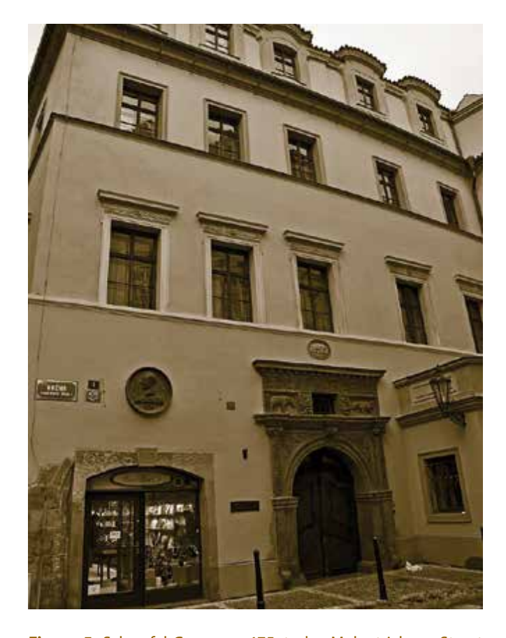
Figure 5. Schwefel Gasse no. 475, today Melantrichova Street no. 16

From 1844 to 1847, he lived in the centre of Prague (near the Old Town Square), at Schwefelgasse no. 475/I. Since 1894, it has been called Melantrichova Street (no. 16). Above the entrance are sculptures of two golden bears. That is why the house is called "House at the Two Golden Bears" (Dům u Dvou Zlatých Medvědů). It is a large Renaissance building, one of the oldest buildings in Prague, built in 1559–1567 on the site of two Gothic houses. The building was reconstructed in 1975–1980 [21–23] (Figure 5). In 1846, his teacher J. N. Fischer lived in Prague's New Town at Heinrichsgasse no. 889 on the ground floor (today Jindřišská 17) [24].