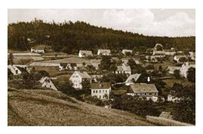
Figure 2. Birthplace of Ferdinand von Arlt in Obergraupen (Horní Krupka), early 20th century (arrow)

by Prince Johann von Clary und Aldringen (1753–1826) [1]. The school was in the centre of the village next to St. Valentine's Church. Today, on that site at the address Vrchoslavská 2/3, is a three-story residential building. He attended grammar school from 1825 in Leitmeritz (today Litoměřice) in Jesuitengasse, which was located next to the Episcopal Priestly Seminary (former Jesuit residence). In Litoměřice he had accommodation at the grammar school (alumnat) [2]. Today this is Jesuit Street no. 18 and 20, and the former seminary was at no. 22.