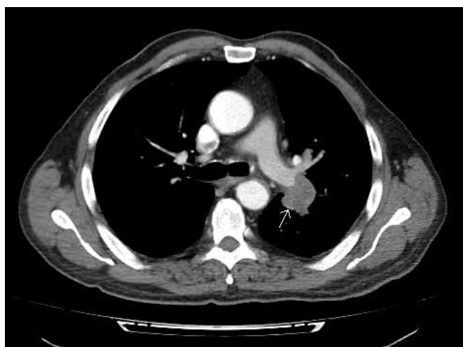
Figure 2. Lymph node in the hilar area 30*24mm (marked with a white arrow)

chronic disease, other than hypertension, and he was a smoker.