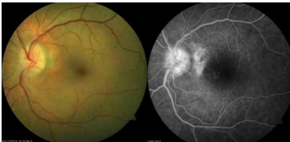
Figure 1. Swelling in the left optic disc in the fundus photo (left image). Hyperfluorescence appearance at the head of the optic disc in the left eye in fundus fluorescein angiography (right image)