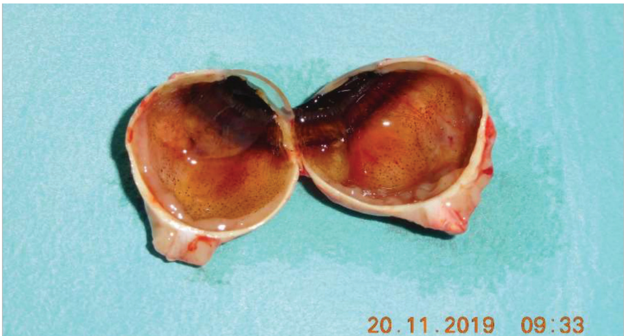
Figure 2. Bulbus after the enucleation: intraocular mass 2x1cm with circular overgrowing around the optic nerve

wall of the bulbus under the choroid was described as a solid infiltration of small lymphocytes, with a round or slightly folded nuclear membrane, lumpy chromatin, central nucleus, small amount of cytoplasm, with formation of germ / proliferative centres; mitotic activity was low. The same infiltration was in the retrobulbar tissue around the optic nerve.