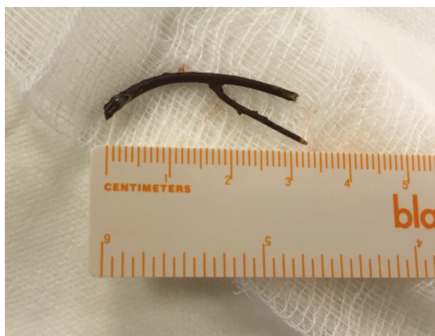
Fig. 4b. Extracted twig from anterior part of orbit

whether the eyeball and optic nerve are damaged or threatened. Penetrating injury of the eyeball must be unequivocally excluded. If the patient's condition so allows, we must examine visual acuity and the ocular fundus.