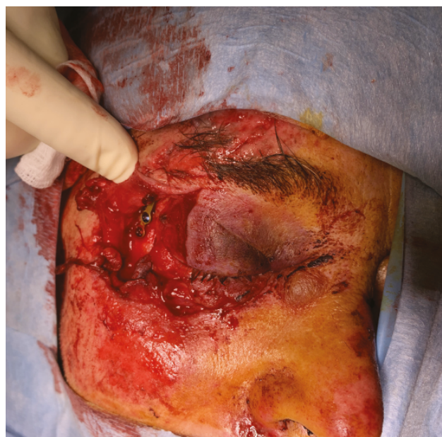
Fig. 6a. Severe injury to orbit and eyelids in traffic accident. Performed reconstruction of the fracture of the outer wall of the orbit by a stomatosurgeon is visible