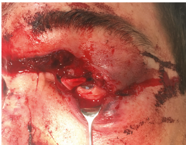
Fig. 5a. Industrial injury by saw. The wound on the upper eyelid is deep enough to cause damage to the musculus levator palpebrae superioris

Minor superficial injuries to the eyelids can be resolved conservatively, with the application of antibiotic cream.