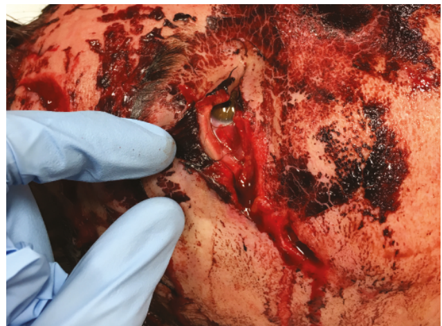
Fig. 3a. Open wound of outer corner, including torn lower canthal ligament. Patient after traffic accident