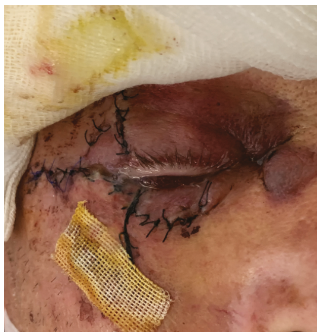
Fig. 6b. Finding at follow-up examination on the first day after reconstruction