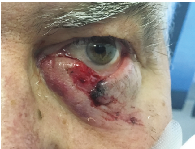
Fig. 2. Lacerated injury to lower eyelid caused by small dog, without injury of canaliculus