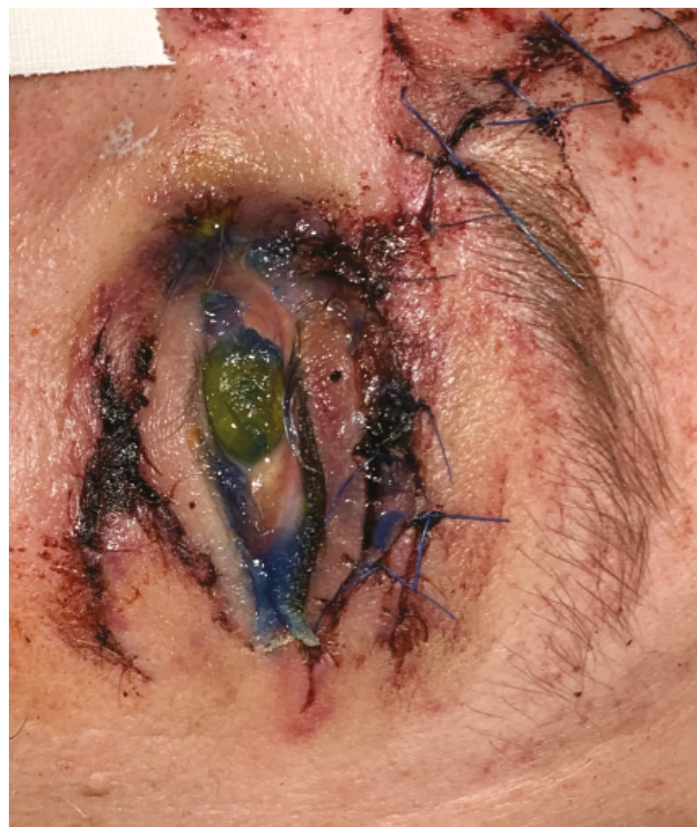
Fig. 8. Photograph shows a rarer complication of oculoplastic traumas – patient after injury (traffic accident) – probably loss injury of upper eyelid following primary reconstruction – with a finding of exposure keratitis with lagophthalmos upon a background of inability to close ocular aperture

This is a relatively rare but serious sight-threatening complication. It represents an urgent condition in which