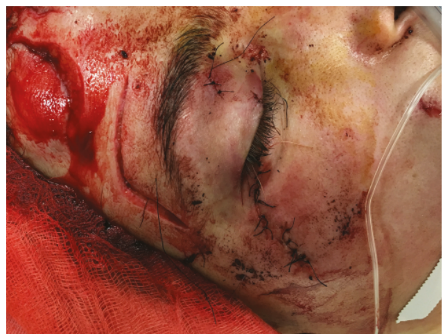
Fig. 3b. State after reconstruction of eyelids by ophthalmologist