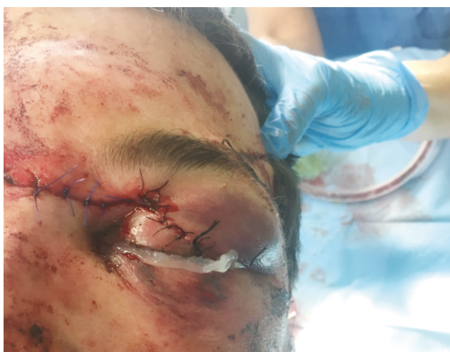
Fig. 5b. Condition immediately after reconstruction of the eyelid by an ophthalmologist