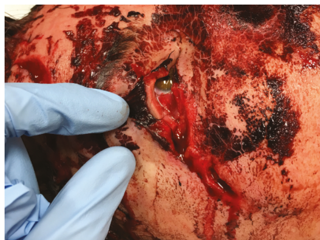
Fig. 3a. Open wound of outer corner, including torn lower canthal ligament. Patient after traffic accident