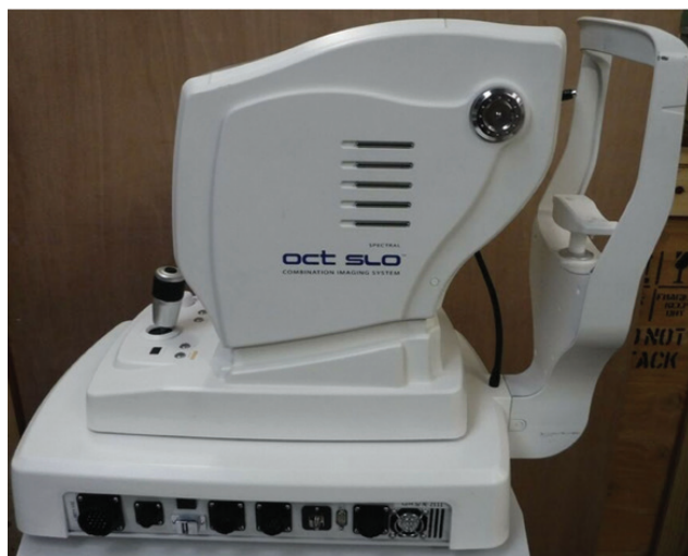
Fig. 1. Special Optical Coherence Tomography instrument

Progression of glaucoma took place in a total of 11 right eyes of the patients (designation 1). This means that 20 right eyes of the patients were without progression (designation 0) in the observation period. At the time of the first examination, a total of 21 eyes were negative (0) according to OCT in all quadrants. From this it ensues that only 1 eye produced a false negative. The average simplified categorised va-