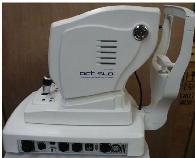
Fig. 1. Special Optical Coherence Tomography instrument

According to certain studies (5), in the case of spectral domain OCT it is possible to attain sensitivity of as high as 96% and specificity of 76%. The aim of our retrospective study was to evaluate data obtained thanks to RNFL analysis in 4 observed summary quadrants and compare it with the resulting diagnosis of glaucoma neuropathy determined subsequently primarily on the basis of changes in the visual field. A specific feature of our study is the categorisation (0-