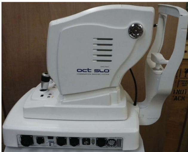
Fig. 1. Special Optical Coherence Tomography instrument

According to certain studies (5), in the case of spectral domain OCT it is possible to attain sensitivity of as high as 96% and specificity of 76%. The aim of our retrospective study was to evaluate data obtained thanks to RNFL analysis in 4 observed summary quadrants and compare it with the resulting diagnosis of glaucoma neuropathy determined subsequently primarily on the basis of changes in the visual field. A specific feature of our study is the categorisation (0-