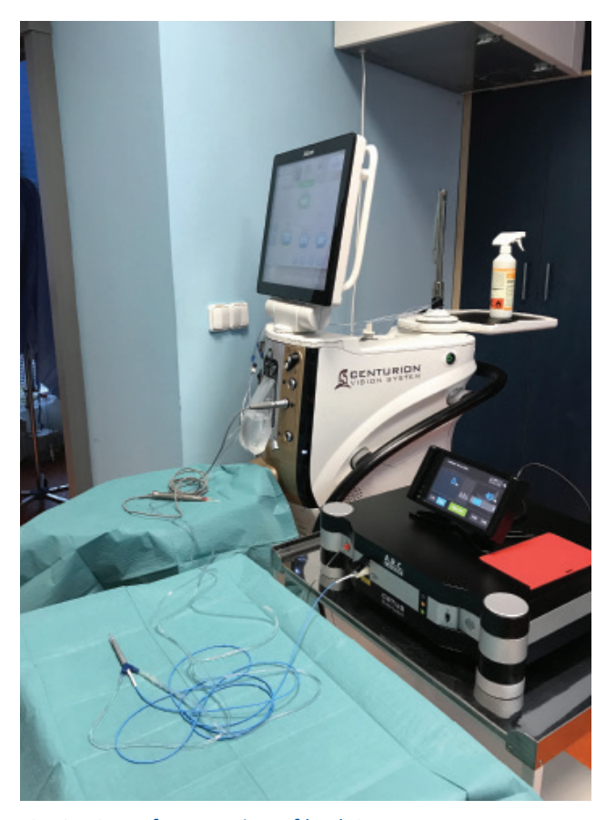
Fig. 3. View of connection of both instruments

After 7 days, both groups had very similar results of improvement of UCVA, which attests to rapid rehabilitation of vision in both techniques. Similar results are also stated in the literary sources (1, 2, 3, 6).