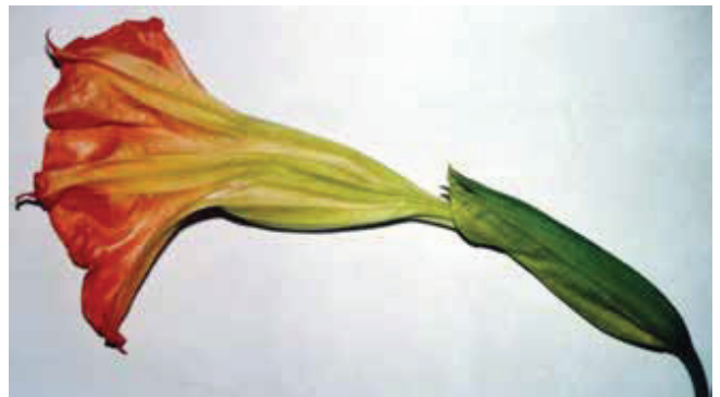
Fig. 2. Goblet-shaped flower of plant Datura suaveolens

in the left eye, there was also no constriction of the pupil. A test with 1.0 Pilocarpine differentiates a neurogenic cause of mydriasis from mydriasis caused by a cholinergic antagonist. If the muscarinic receptors on the affected side are occupied by an anti-cholinergic agent, 1% Pilocarpine leads to weak or no miosis. By contrast, in the case of neurogenic causes of mydriasis, clear constriction of the pupil takes place upon its application (2). In this case therefore the pharmacological test confirmed mydriasis induced by an anti-cholinergic agent. After a number of targeted questions (what was the child doing, where was it playing, with what did she come into contact, for example plants?) we determined contact with the plant Datura suaveolens , known as “Brazil's white angel's trumpet” (Fig. 2). The child broke off and held in her hand a goblet shaped flower of this plant. The medical history of contact with Datura suaveolens , which contains alkaloids such as L-hyoscyamine, atropine and above all scopolamine, therefore corresponded with the objective finding in the child – juice from the flower probably came into contact with only one eye. The child's agitation and reddening of the cheeks could also have been a symptom of mild general intoxication. Spontaneous correction ad integrum took place without therapy within 24 hours (Fig. 3).