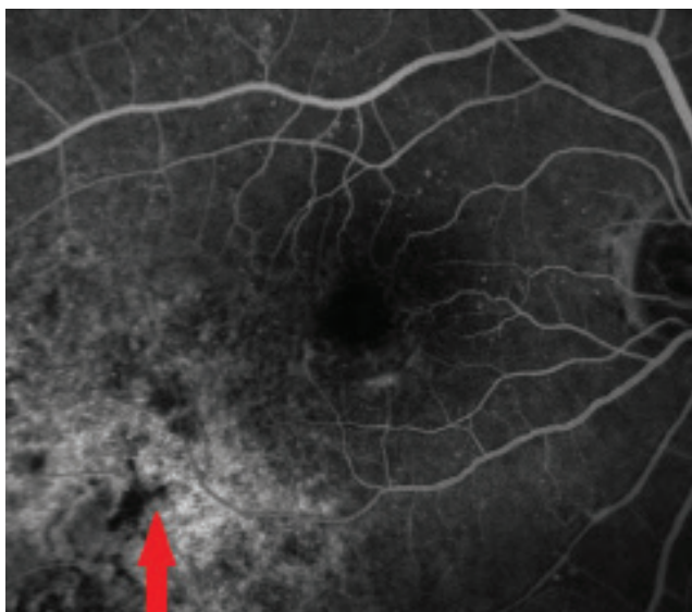
Fig. 3. Fluorescein angiography of tumour deposit 4 years later in 2017

acuity after the intravitreal administration of bevacizumab.