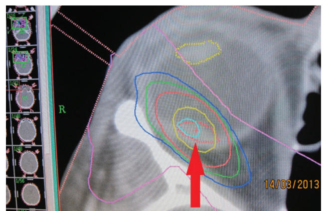
Fig. 2. Stereotactic plan of irradiation of deposit in 2013