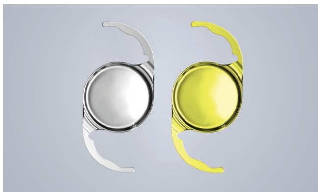
Fig. 1. Lens CT LUCIA 611P (Y)

The improved construction of the “C-loop” haptics, with special curvature without angulation, guarantees a further improved stabilisation and fixation of the lens