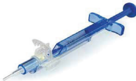
Fig. 2. Injector of lens CT LUCIA 611P (Y)