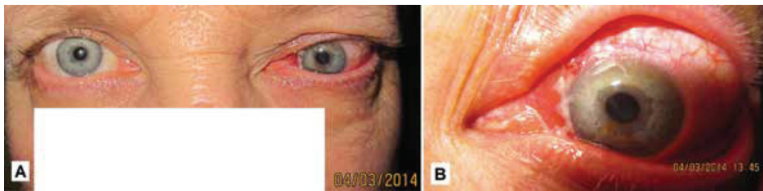
Fig. 2 Clinical picture of the same patient in March 2014 – progression with tendency of infiltration into orbit