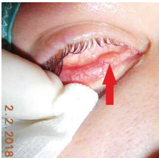
Fig. 3 Clinical picture of a patient with papilloma of conjunctiva on the inner side of lower eyelid