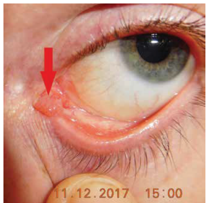
Fig. 4: Clinical picture of a patient with papilloma of caruncula