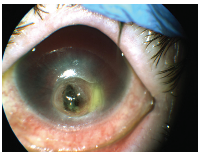
Fig. 2 Keratomalacia with extensive perforation of the cornea