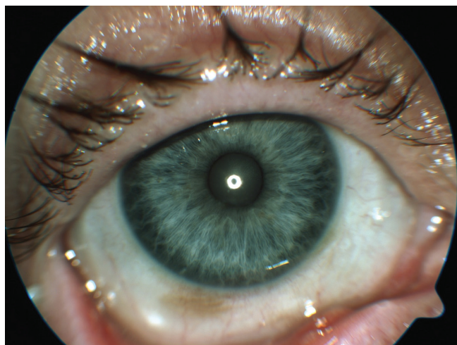
Fig. 3 Finding 3 weeks after commencement of vitamin A substitution per os

patient did not report for any of the originally recommended follow-up examinations.