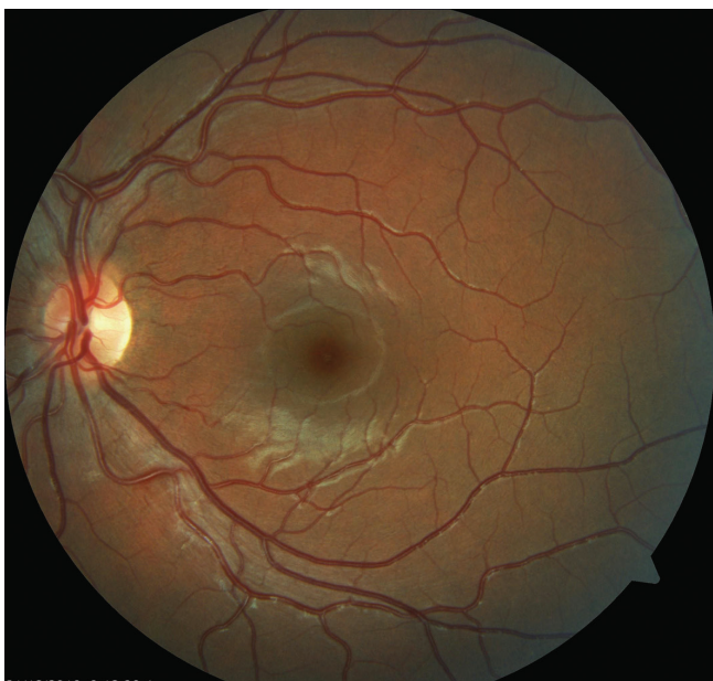
Fig. 2 Colour photographic image of fundus of left eye: physiological finding on ocular fundus

A biomicroscopic examination of the ocular fundus of the right eye (RE) in mydriasis demonstrated thinning of the retina