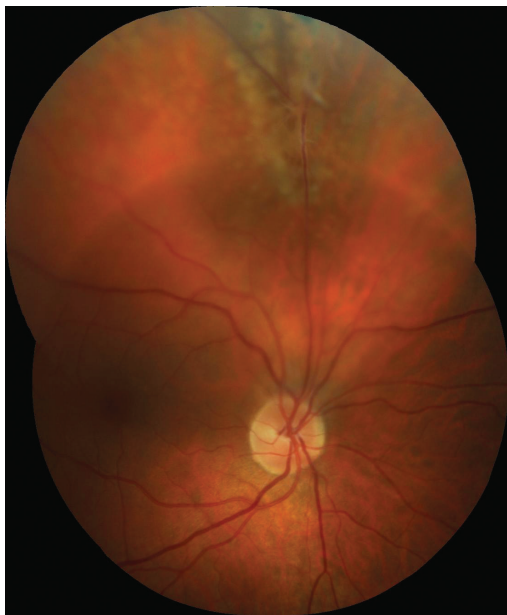
Fig. 4 Colour photographic image of fundus of right eye: proximal segment of persistent hyaloid artery binding to upper temporal arcade, with local tractional retinal detachment of an older date