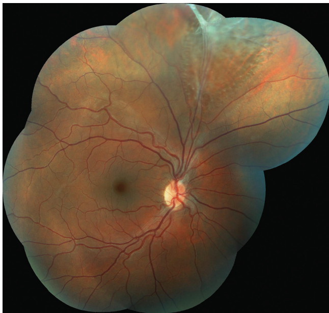
Fig. 1 Colour photographic image of the fundus of the right eye: the retina is thinned in the upper quadrants, in the upper temporal arcade there are residues of persistent hyaloid artery with fibrotic tissue, causing local retinoschisis of an older date.

method was within the norm, in the right eye 17 torr and in the left eye 13 torr. Visual acuity (VA) evaluated with the aid of Snellen's optotypes was as follows: uncorrected visual acuity (UVA) in right eye 0.4, with correction -0.5cyl on an axis of 40° 0.8, in left eye UVA 0.8, not improved by correction. Upon examination on a slit lamp, the finding on the anterior segment was bilaterally physiological.