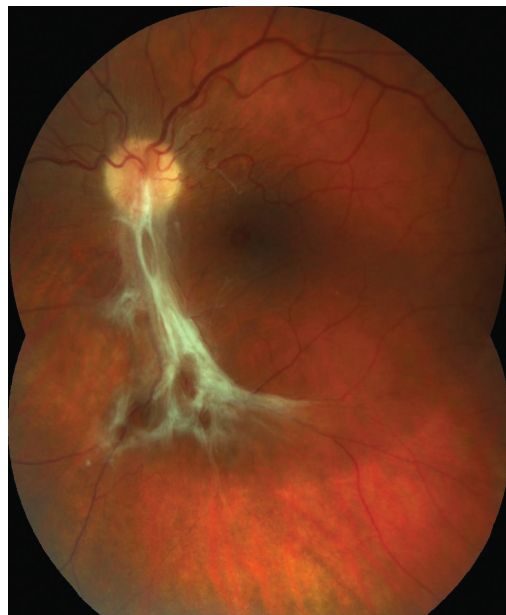
Fig. 5 Colour photographic image of fundus of left eye: preretinal fibrosis in lower temporal arcade causing draping of retina in central landscape

posterior capsule of the lens (fig. 3), also physiological finding on the RE as well as LE. Fundoscopy in mydriasis of the RE demonstrated a proximal part of the PHA adhering to the upper temporal arcade, where it conditioned the origin of local TRD of an older date (fig. 4), in the surrounding area there were