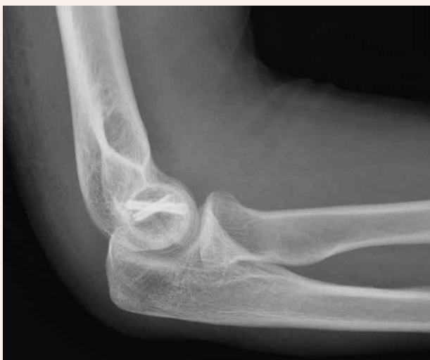
Figure 4 | Post-operative radiograph of the left elbow (lateral view) demonstrating two intraosseous screws providing reduction of the capitellar fragment