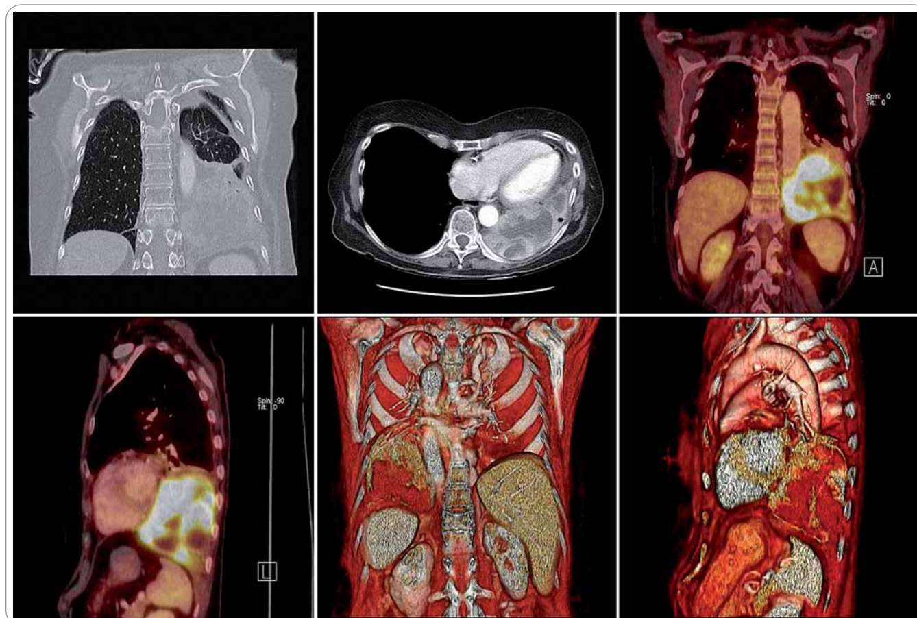
Fig. 1. CT images of the tumor before the surgery. The tumor arises from the lower left lung lobe and invades the diaphragm.

The histogenesis of SARC remained unclear for a long time due to its histo-