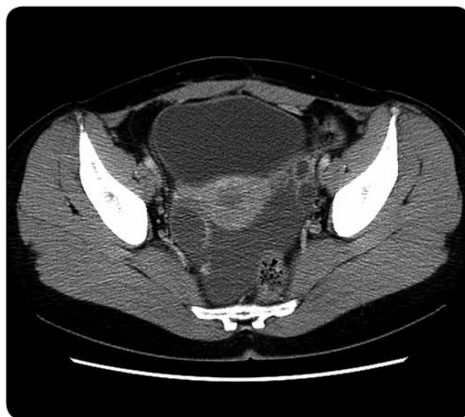
Fig. 2. Large tumor mass in the pelvis prior to initiation of treatment; March 2008.

CK8/18, CD31) were negative. Similarly, immunohistochemistry for C-kit was negative.