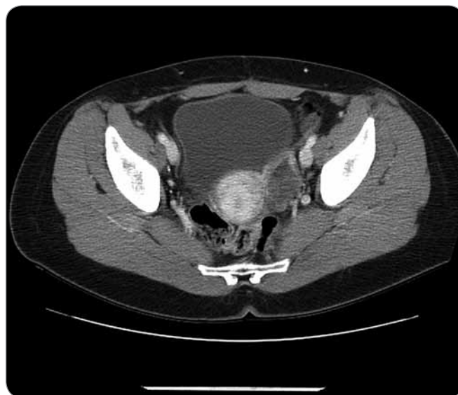
Fig. 4. Significant regression of finding in the pelvis after imatinib therapy; persisting residual cystoid in the left ovary; December 2010.

imatinib mesylate to patients with c-kit negative GISTs, it is necessary to request reimbursement for each respective case.