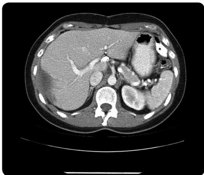
Fig. 3. Significant liver tumor regression during the treatment with imatinib; abdominal metastases are not depicted; December 2010.