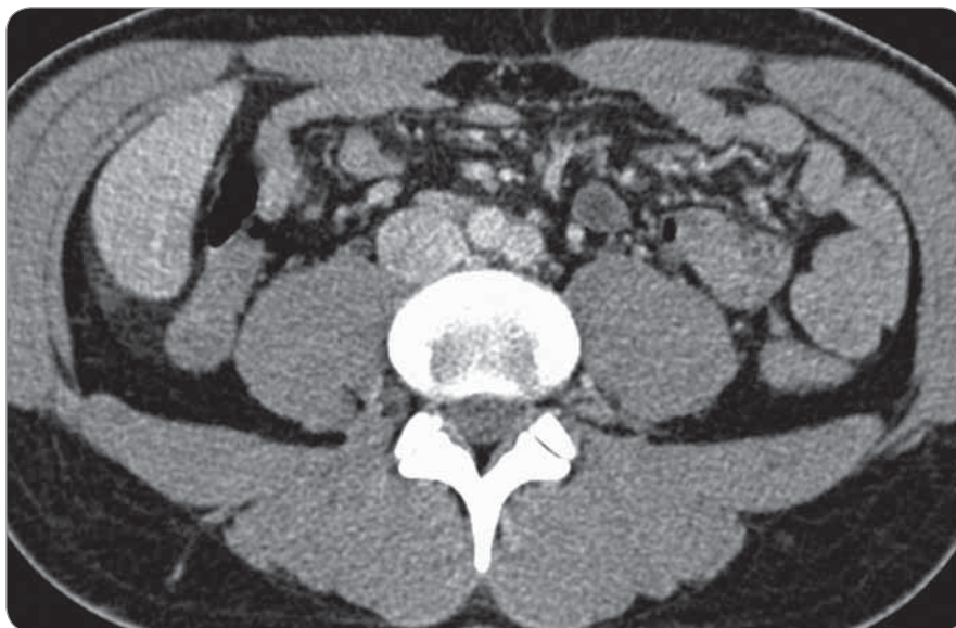
Fig. 1. Axial CT of pathologic para-aortic lymph nodes.

Past medical history is noteworthy for right cryptorchidectomy in two years of age. The patient underwent right orchi-funiclectomy with a placement of a testicular prosthesis and extirpation of the left testis nodule. The histo-pathological examination revealed bilateral seminoma; the right tumor mass measuring 2.5 cm in diameter, with peritumoral vascular and lymphatic vessel invasion. The left nodule was 0.3 cm in diameter. The staging CT scan showed lymphadenopathy within the para-aortic and the right com-