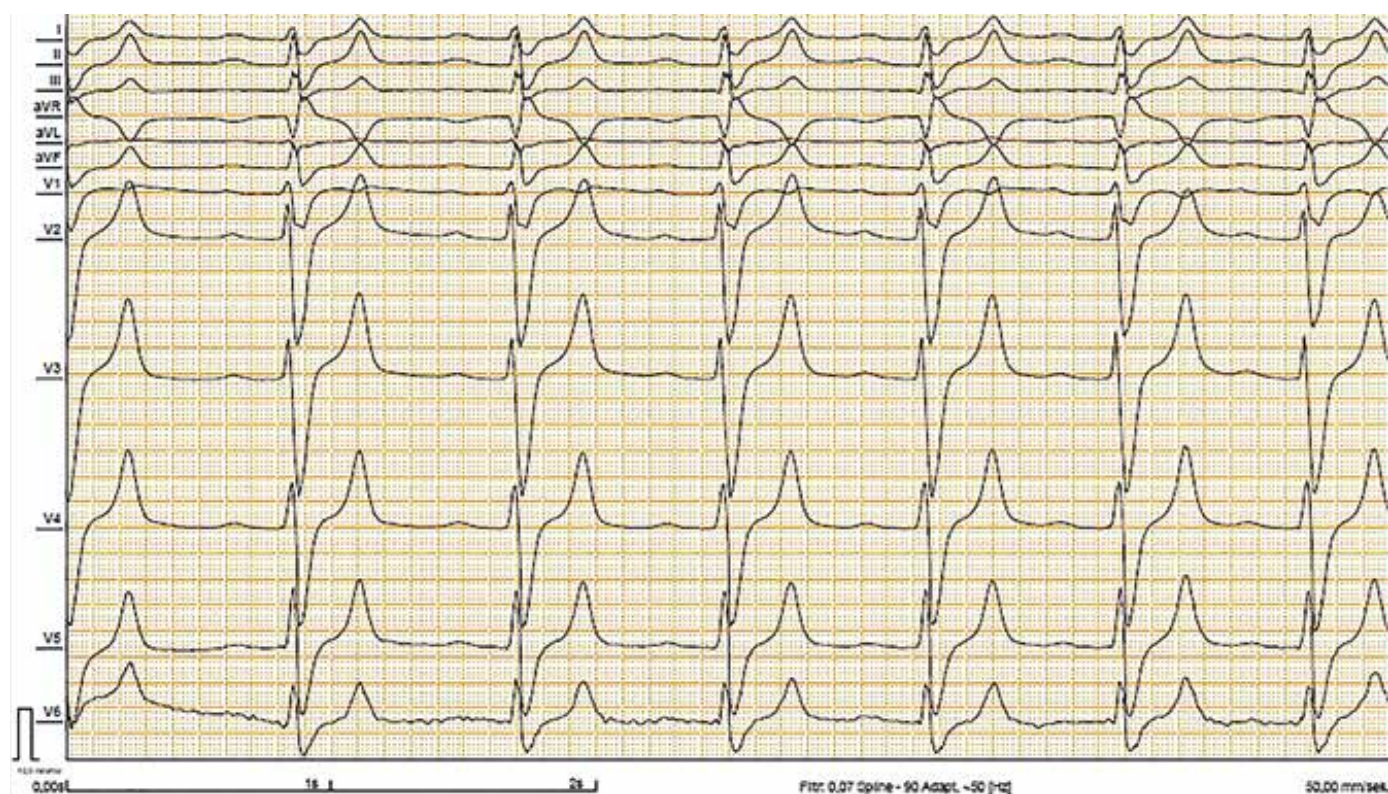
Figure 1. ECG changes in severe hyperkalemia

An electrocardiogram performed immediately after admission revealed changes typical of severe hyperkalemia (tall, peaked T waves and widened QRS complexes) (Figure 1). To treat hyperkalemia we used calcium gluconate, inhaled \beta -agonist salbutamol, and intravenous sodium bicarbonate. This approach dropped the blood serum potassium to 5.9 mmol/L. A permanent urinary catheter was inserted to accurately measure urine output. Abdomen ultrasound revealed slightly increased echogenicity of the kidney parenchyma. After insertion of a central venous catheter, intermittent hemodialysis (IHD) was initiated. Enzyme immunoassay (EIA) of stool sample was positive for C. difficile antigen but negative for toxins. However, genes for toxins A and B of C. difficile were the only positives on the gastrointestinal (GIT) panel of patient's stool sample (a polymerase chain reaction test for detecting 22 common gastrointestinal pathogens). According to this finding, we indicated antibiotic treatment with fidaxomicin, a bactericidal macrolide, for 10 days. We continued IHD for the next 7 days. Azotemia was improving and urine output was gradually increasing. Development of serum creatinine levels