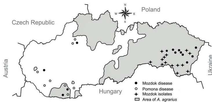
Figure 1. Chart of the Slovak republic illustrating the regional distribution of patients with Pomona and Mozdok diseases, sites of isolation of Mozdok strains from Apodemus agrarius and areas of this feral rodent

Mozdok serovars were chosen as suitable candidates for further examination.