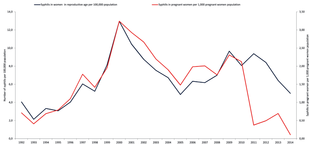
Figure 3. Number of reported syphilis cases in women in reproductive age per 100,000 women population in reproductive age and in pregnant women per 1,000 pregnant women in period of 1991–2014