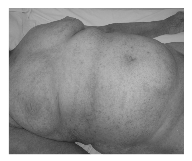
Fig. 1. Norwegian scabies affects an immunosuppressed patient. Disseminated partially confluent erythematous exantema was localized on the trunk, back, abdomen and on the inner site of upper limbs and things

An 85-year-old woman suffering from bullous pemphigoid with four months history of confluent maculous exanthema on the skin and pruritus was referred for evaluation. A presumptive diagnosis of an adverse drug reaction was made at the Dpt.of Internal Medicine, where the patient was hospitalised with aggravation of her heart ischemic disease. Hydrochlorothiazide, and lacipil were suspected of drug allergy and changed for another group of drugs. The patient suffered from bullous pemphigoid from 2005 that was proved