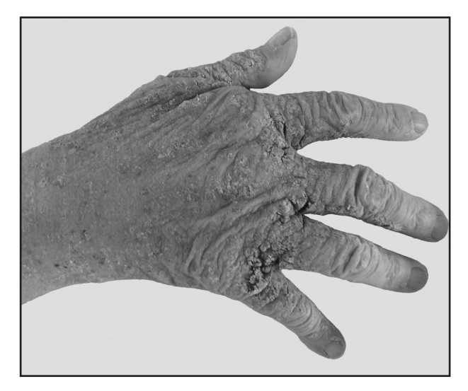
Fig. 2. Hyperkeratotic-crusted lesions were localised on the dorsal aspects of the hands and between the fingers.