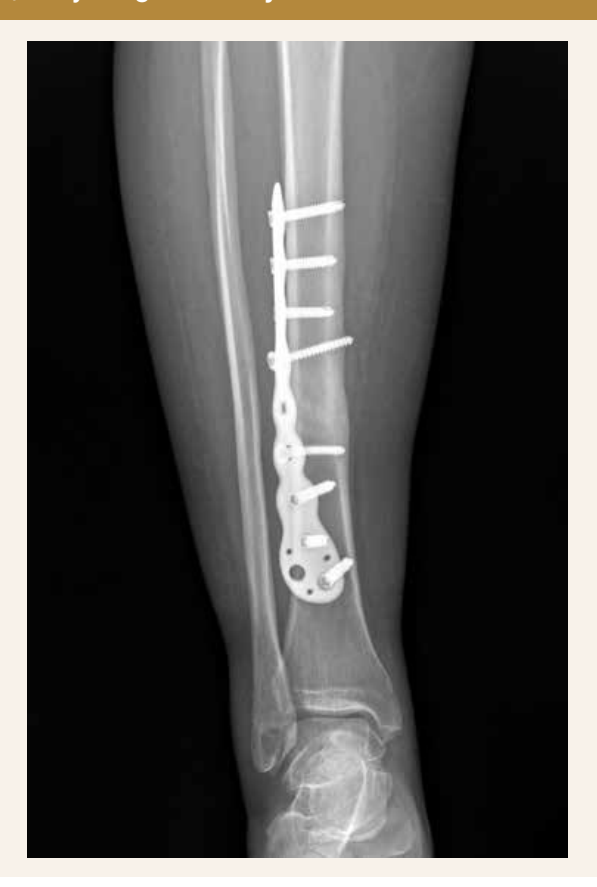
Fig. 4 | X-ray image of the injured limb after 3 months after the third injection. Signs of callus remodeling

One of the factors in the development of this complication is the violation of bone tissue trophism. It is known that the vascularization and vitality of bone fragments are of great importance for the callus formation. Thus, any fracture of the diaphysis of the tubular bone is accompanied to a greater or lesser extent by damage to the soft tissues; in this case, the vessels and nerves