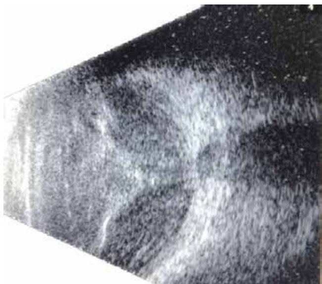
Figure 1. B-scan demonstrated a near-kissing suprachoroidal hemorrhage

the right eye was deep with an open angle. His intraocular pressure (IOP) was 68 mmHg over the left eye and 19 mmHg over the right eye. Fundus examination revealed suprachoroidal hemorrhage and was confirmed with an ultrasound scan (B scan) of the left eye, which demonstrated a near-kissing suprachoroidal hemorrhage (Figure 1). His blood pressure (BP) was 196/106 mmHg. His complete blood count and coagulation test were normal. He was admitted; thus, oral Acetazolamide 250 mg four times daily and syrup glycerol (1 g/kg body weight) thrice daily was commenced. Locally Gutt Timolol twice daily, Gutt Latanoprost at night, Gutt Dorzolamide thrice daily, and Gutt Brimonidine thrice daily were given to control his eye pressure. Two antihypertension medications were also started to control his blood pressure. Despite maximum medical therapy, his intraocular pressure was persistently high. He underwent left eye suprachoroidal drainage surgery, which subsequently managed to maintain his intraocular pressure. Unfortunately, his vision remained poor postoperatively, despite surgery, good IOP and BP control.