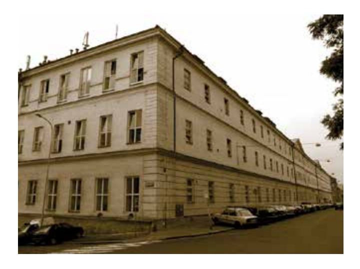
Figure 3. Eye Clinic was located on the second floor in the east wing of the general hospital in Prague (today U Nemocnice 2)

Von Arlt was the first to give an accurate description of trachoma (1855) and was the first to understand the essence of the pathogenesis of myopia (1854), arguing