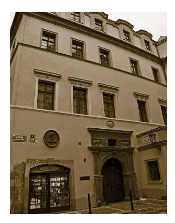
Figure 5. Schwefel Gasse no. 475, today Melantrichova Street no. 16

From 1844 to 1847, he lived in the centre of Prague (near the Old Town Square), at Schwefelgasse no. 475/I. Since 1894, it has been called Melantrichova Street (no. 16). Above the entrance are sculptures of two golden bears. That is why the house is called "House at the Two Golden Bears" (Dům u Dvou Zlatých Medvědů). It is a large Renaissance building, one of the oldest buildings in Prague, built in 1559–1567 on the site of two Gothic houses. The building was reconstructed in 1975–1980 [21–23] (Figure 5). In 1846, his teacher J. N. Fischer lived in Prague's New Town at Heinrichsgasse no. 889 on the ground floor (today Jindřišská 17) [24].