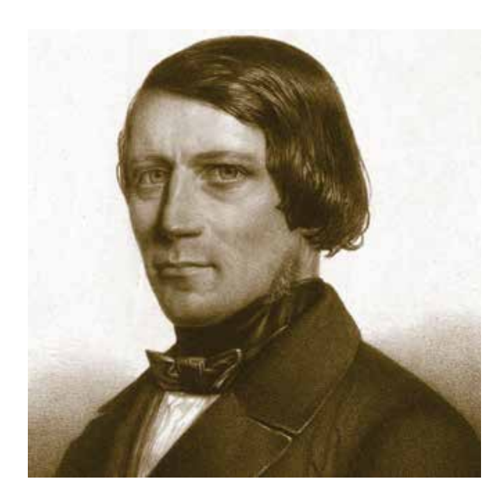
Figure 1. Ferdinand von Arlt (1812–1887) at the age of about 40 (Lithograph by Moritz Golde, printed in the studio of Franz Hanfstaengl in Dresden)