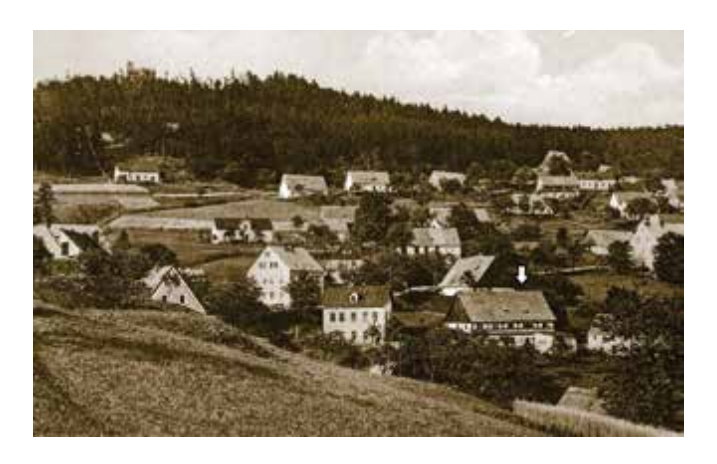
Figure 2. Birthplace of Ferdinand von Arlt in Obergraupen (Horní Krupka), early 20th century (arrow)

by Prince Johann von Clary und Aldringen (1753–1826) [1]. The school was in the centre of the village next to St. Valentine's Church. Today, on that site at the address Vrchoslavská 2/3, is a three-story residential building. He attended grammar school from 1825 in Leitmeritz (today Litoměřice) in Jesuitengasse, which was located next to the Episcopal Priestly Seminary (former Jesuit residence). In Litoměřice he had accommodation at the grammar school (alumnat) [2]. Today this is Jesuit Street no. 18 and 20, and the former seminary was at no. 22.