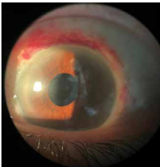
Figure 4. Post-operative view of the corneal surface after excisional biopsy

infiltration and thick bundles of collagen fibers throughout the stroma. Furthermore, the top of the lesion was not covered with the epithelium and was replaced by a fibrino-leukocytic exudate and, on investigation of the base of the lesion, no corneal intraepithelial neoplastic cells in favor of CIN could be detected (Figure 2). These histopathological findings along with the macroscopic appearance of the lesion were more in favor of chronic or late-stage of a non-lobular type of pyogenic granuloma or granulation tissue. Therefore, we also performed anti-CD34 immunohistochemical staining to determine the vascularity of the lesion (Figure 3).