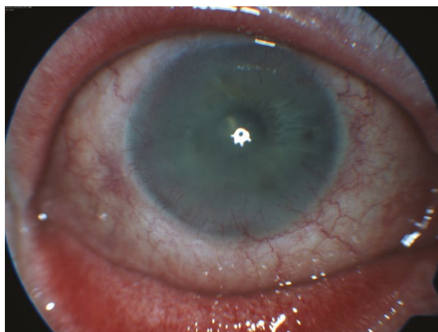
Fig. 5. Right eye of patient from case report 2 with mixed injection of conjunctiva, semitransparent cornea and peripheral limbal superficial and deep corneal vascularisation

A seventy two year old woman was sent to our centre by a local ophthalmologist due to bilateral keratitis upon a background of general pathology of rosacea, for which she had been receiving treatment since 2016. She stated deterioration of vision over the course of approx. 3 weeks, lachrymation and reddening of the eyes. BCVA in the right eye was 1.5/60, in the left eye 0.3/60. Actinic keratosis was visible on the face (Fig. 4). The following finding on the anterior segment was recorded bilaterally: conjunctiva with mixed injection, seropurulent secretion and follicular reaction, cor-