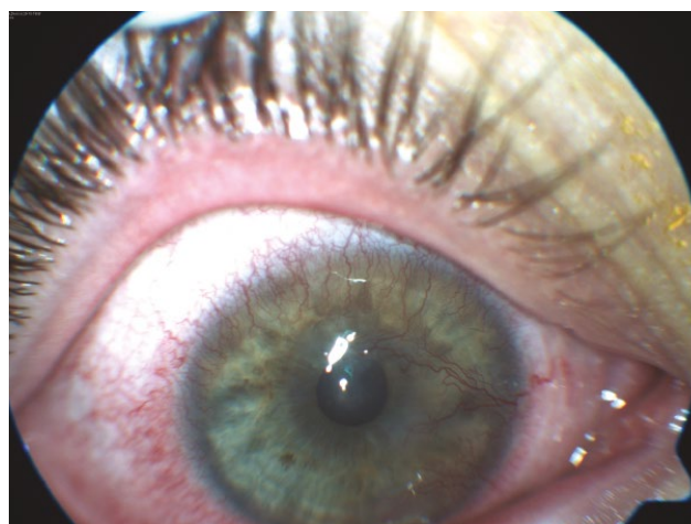
Fig. 2. Right eye of patient from case report 1, visible mixed corneal vascularisation