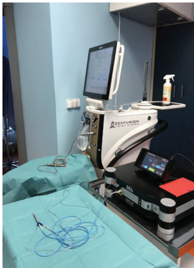
Fig. 3. View of connection of both instruments

After 7 days, both groups had very similar results of improvement of UCVA, which attests to rapid rehabilitation of vision in both techniques. Similar results are also stated in the literary sources (1, 2, 3, 6).