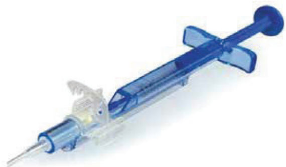
Fig. 2. Injector of lens CT LUCIA 611P (Y)