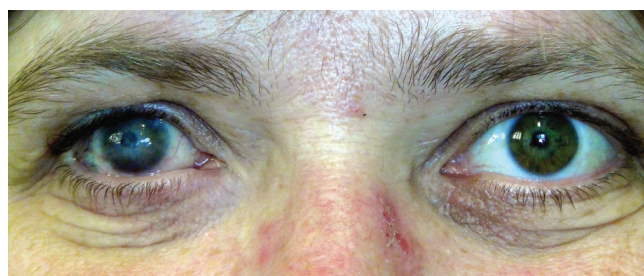
Fig. 8 and 9. Patient no. 4 before and after KTP procedure