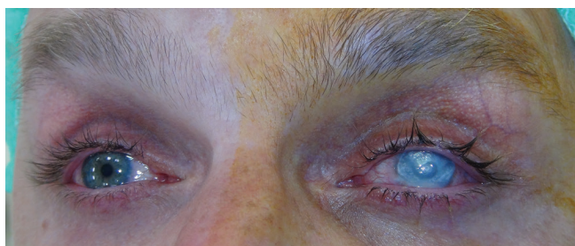
Fig. 2 and 3. Patient 1 before and after KTP procedure

Under instillation anaesthesia we removed the altered corneal epithelium, and subsequent keratopigmentation was performed similarly as on the previous patients. We left a soft therapeutic contact lens for 7 days, antibiotic therapy with eye drops (Oftaquix gtt., Santen, Finland) was applied for 14 days. On the 7th postoperative day the eyeball was