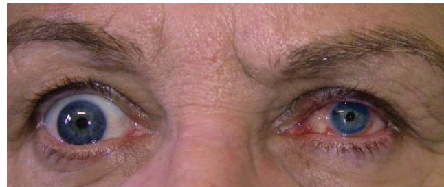
Fig. 4 and 5. Patient 2 before and after KTP procedure