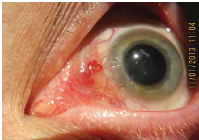
Fig. 1: Clinical picture of a patient with inverted type of conjunctival papilloma in the nasal section of the bulbar conjunctiva (1/2013)

The prevalence of conjunctival papillomas depends on geographical region, but in general it is higher than the prevalence of conjunctival carcinomas. There is a higher incidence in individuals of Caucasian race, male sex, and people aged between 50 and 75 years. In our cohort the highest incidence of lesions was in patients aged between 60 and 70 years, which is in accordance with the available publications. In our cohort we also recorded a higher