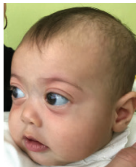
Fig. 2: Central facial dysmorphism, shallow orbits, pseudoexophthalmos, hypertelorism and low root of nose in patient with Marshall/Stickler syndrome at age of 4 months.