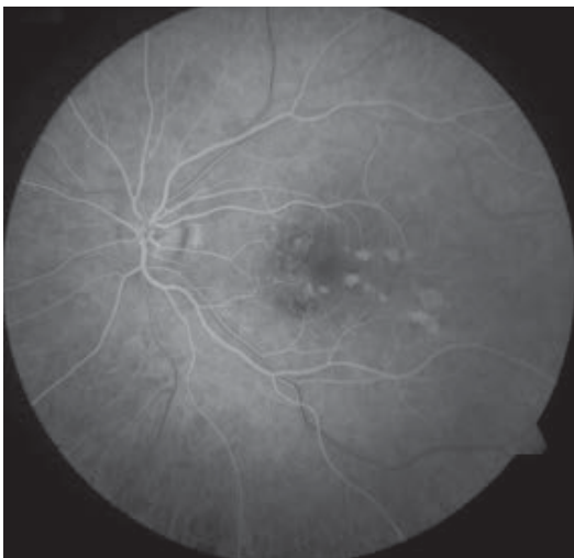
Fig. 3 FAG of left eye. Hyperfluorescence of window defects of RPE in place of inactive inflammatory lesion