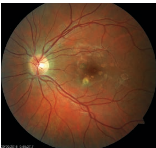
Fig. 5 Left eye. Original active deposit on retina progressively bordering and partially pigmenting