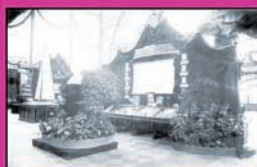
II. International pharmaceutical exhibition in Prague 1896 organized on the occasion of the 25th anniversary of the Czech Pharmaceutical Society activities.

The scope of the study was identified by the results of the review of pharmaceutical and medical journals; archival sources and collections of the Czech Pharmaceutical Museum in Kuks were examined.